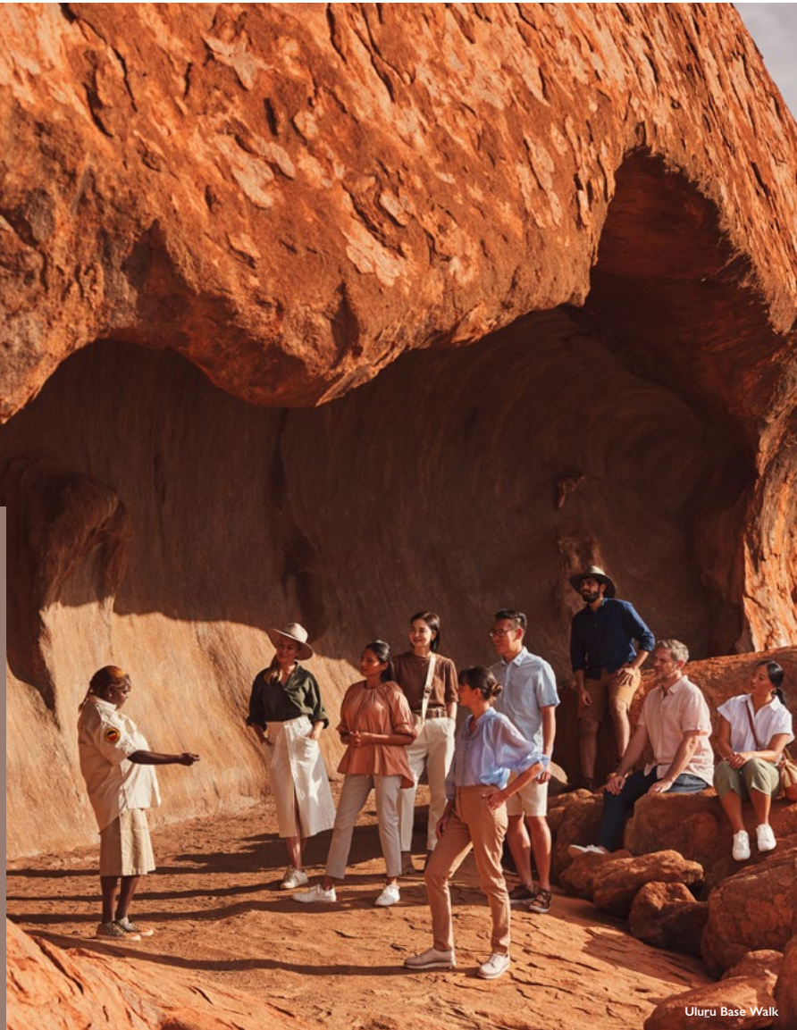
Uluru Base Walk