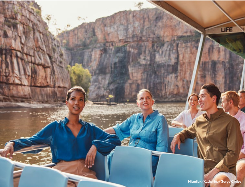
Nitmiluk (Katherine) Gorge Cruise

As this journey departs from Hilton Darwin at 7.30am, accommodation will need to be pre-booked for the previous night.