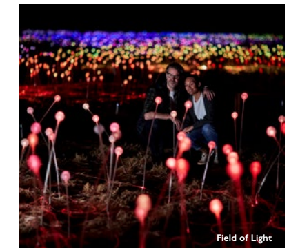
Field of Light